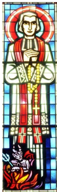
Christ the King Chapel La Crosse, Wisconsin

SACERDOTII NOSTRI PRIMORDIA ENCYCLICAL OF POPE JOHN XXIII ON ST. JOHN VIANNEY AUGUST 1, 1959