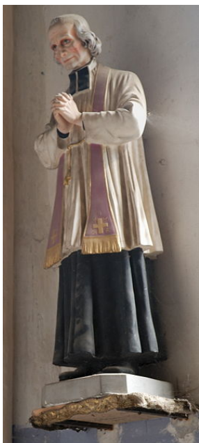
St. John Vianney 1786-1859

Statue: Holy Cross Diocesan Center, La Crosse, WI.