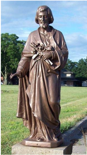
Statue: St. Joseph Community Care, La Crosse, WI.

Sacred Scripture: “Faith is the assurance of things hoped for, the conviction of things not seen” Hebrews 11:1 .