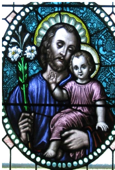
Window: St. Philip Parish, Rolling Ground, WI.