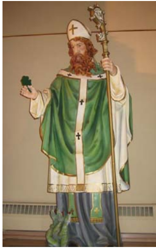
St. Patrick Statue: Notre Dame Parish, Chippewa Falls, WI