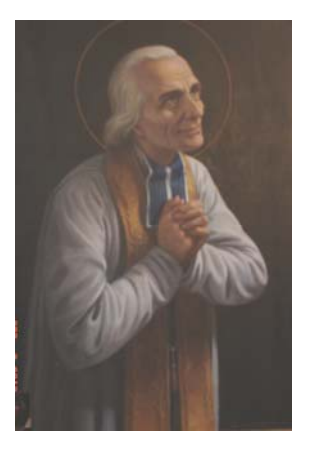
Painting: Mundelein Seminary, Mundelein, ILL

"Christ, by rising to new life, has taught us 'that evil never has the last word, that love is stronger than death, and that our future, and the future of all humanity, lies in the hands of a faithful and provident God.' In every time and place the Church is called to proclaim this message of hope and to confirm its truth by her practical witness of holiness and charity."