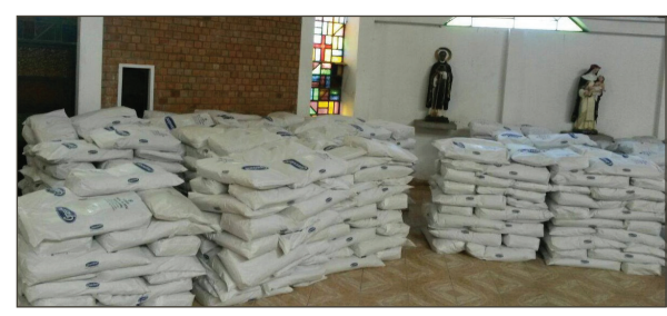
A May 2016 shipment contained 800 50-lb bags of powdered milk for Casa Hogar. The donated milk is used at Casa Hogar and also distributed to other organizations. Hundreds of children in Peru benefit from each shipment!

Thanks to Project Milk, the children at Casa Hogar are able to have milk 365 days a year! Some of their favorite ways to enjoy it are: Arroz con leche (rice milk with cinnamon), Aji de gallina (shredded chicken with a cheesy sauce), or simply as a warm glass of milk on chilly days!