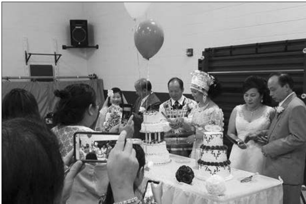
Reception after three Catholic Weddings!