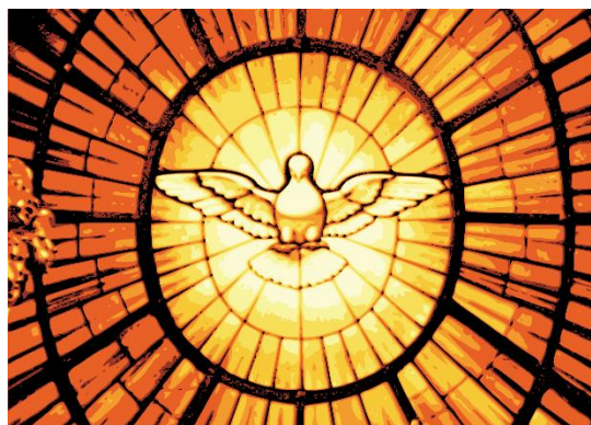
The Holy Spirit is a Divine Person. The dove is a Biblical symbol.

In other words, the Christian life is not about “earning our way to Heaven.” The Christian life is about cooperating with God's grace, and in this freedom, seeks to know the truth of Jesus Christ and to be His committed follower. Jesus is the bridge connecting us to our Father in Heaven. It is the Holy Spirit who leads us to Jesus, helps us to encounter Him and strengthens us to commit our lives to Him. God offers us personal guidance in many ways to stay on the right path, always with the purpose of bringing us to the greatest fulfillment, joy and peace, even amidst life's struggles.