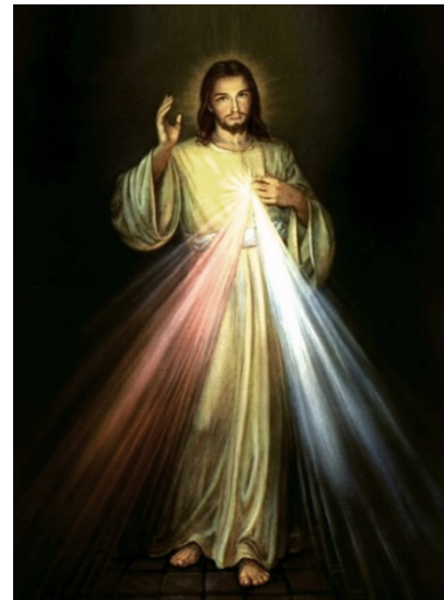
Jesus I trust in You