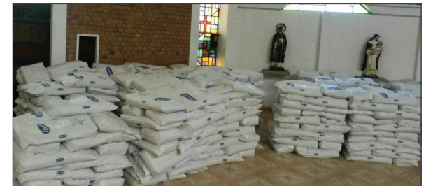
A May 2019 shipment contained 800 50-lb bags of powdered milk for Casa Hogar. The donated milk is used at Casa Hogar and also distributed to other organizations. Hundreds of children in Peru benefit from each shipment!

Thanks to Project Milk, the children at Casa Hogar are able to have milk 365 days a year! Some of their favorite ways to enjoy it are: Arroz con leche (rice milk with cinnamon), Aji de gallina (shredded chicken with a cheesy sauce), or simply as a warm glass of milk on chilly days!