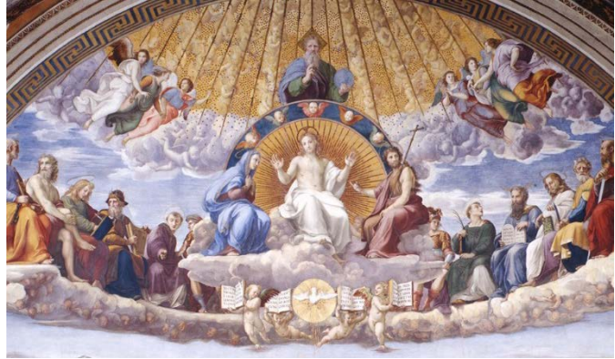
The Blessed Trinity with Biblical images of the Father portrayed as a grandfather and the Holy Spirit as a dove; with Jesus – the Risen Savior – surrounded by Mary, St. John the Baptist, and the Apostles.

Isn't it true that each of us needs to become more committed to speaking with our Heavenly Father on a daily basis? Being intentional about choosing a time for prayer each day and then being dedicated in order to deepen your relationship with Jesus is the path to true happiness (joy) and peace.