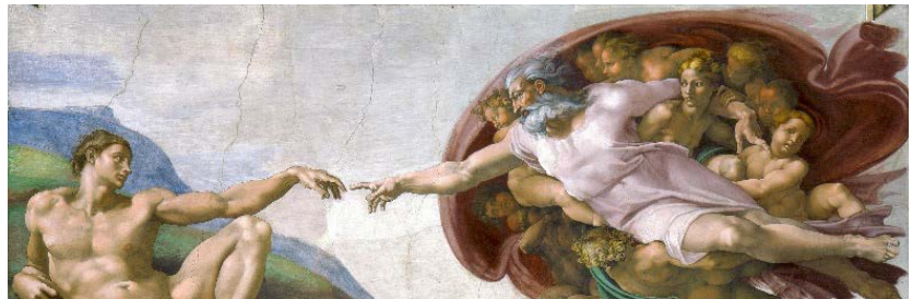
The creation of Adam, with the portrayal of Eve as still in the mind of God