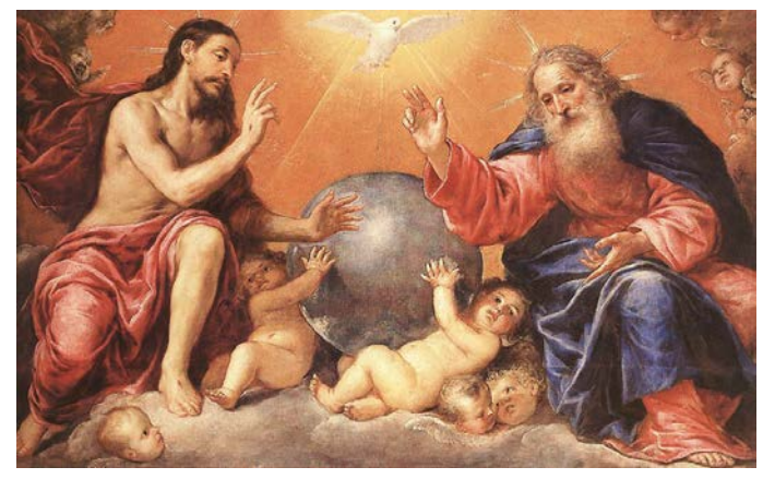
The Blessed Trinity blessing the world, with the Father portrayed as a grandfather and the Biblical image of the Holy Spirit as a dove.