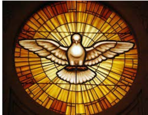
The Holy Spirit is a Divine Person. The dove is a Biblical symbol.

Praying this prayer to the Holy Spirit each day will allow you to deepen your relationship with Jesus as He is revealed to you by the Person of the Holy Spirit. Pray the Prayer to the Holy Spirit two times: the first time for understanding, the second time from the heart. Follow the steps that are listed below.