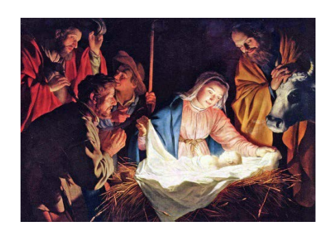
3) Jesus is born in Bethlehem. Guide me to be thankful to God for our Savior.