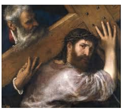
4. Jesus, You carried the Cross. Teach me how to give You my difficulties for peace in the world.