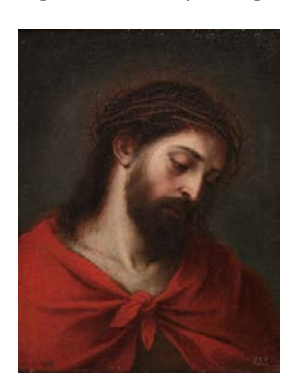
3. Jesus, You patiently endured the Crowning with Thorns. Help me to accept each person.