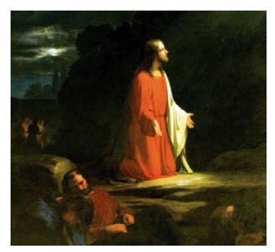
1. Jesus, You prayed and suffered a bitter Agony in the Garden because of my sins. Help me to be faithful to daily prayer.

Each day of Lent, focus on one Mystery of Jesus' life by reading the text by the picture. Ask Jesus to show you how this Mystery applies to your life and gives guidance to you right now.