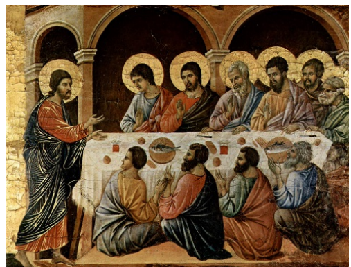
Jesus with the Apostles at the Last Supper