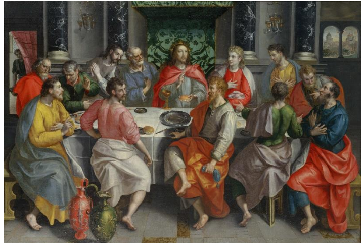
Jesus instituted the Holy Eucharist at the Last Supper.