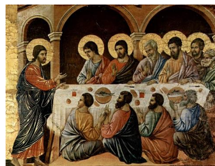
The institution of the Holy Eucharist