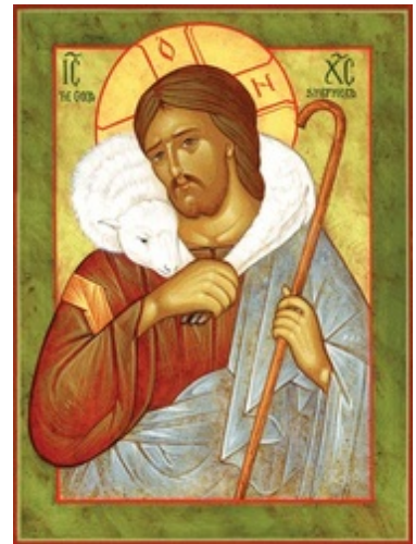
Jesus, the Good Shepherd carrying the sheep as a sign of His great love for us.

We want to detest our sins because we were created to choose the good. In choosing to do wrong and failing to do good, which is called sin, we hurt ourselves and others. The words of this phrase express that we are sorry because of sins consequences: the consideration of sin’s ugliness, the harmful effects that sins have upon us, the penalties threatening the sinner and the fear of eternal separation from God forever if we choose to commit very serious sins. This is a contrition primarily of fear and therefore referred to as “imperfect contrition.” This is not the ideal but God accepts us where we are. (See Catechism of the Catholic Church , hereafter CCC, paragraph 1453)