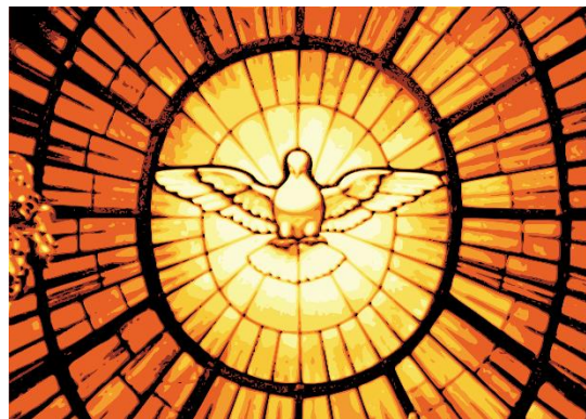
The Holy Spirit is a Divine Person. The dove is a Biblical symbol.

In other words, the Christian life is not about “earning our way to Heaven.” The Christian life is about cooperating with God's grace, and in this freedom, seeks to know the truth of Jesus Christ and to be His committed follower. Jesus is the bridge connecting us to our Father in Heaven. It is the Holy Spirit who leads us to Jesus, helps us to encounter Him and strengthens us to commit our lives to Him. God offers us personal guidance in many ways to stay on the right path, always with the purpose of bringing us to the greatest fulfillment, joy and peace, even amidst life's struggles.