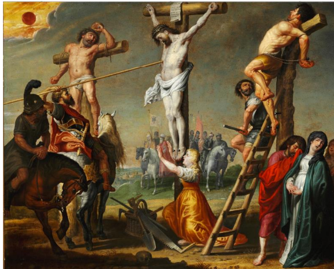
Longinus piercing Christ’s side with a spear