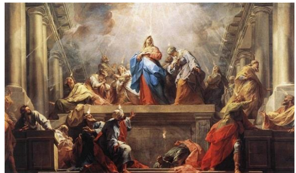
The Holy Spirit coming with great power upon Mary, the Apostles, and the women on Pentecost. (Acts 2:1-4) The Holy Spirit is a Divine Person. The tongues of fire are a Biblical symbol.

You will want to become more aware of how much God loves you. St. Paul tells us that "God's love has been poured into our hearts through the Holy Spirit Who has been given to us." (Romans 5:5) The Holy Spirit is the third Person of the Blessed Trinity. The Holy Spirit was sent by Jesus to live in your heart and bring you closer to Him. It is His power in you that enables you to recognize the voice of Jesus and follow His guidance.