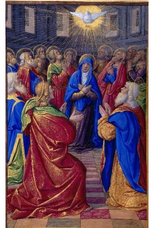
The Day of Pentecost