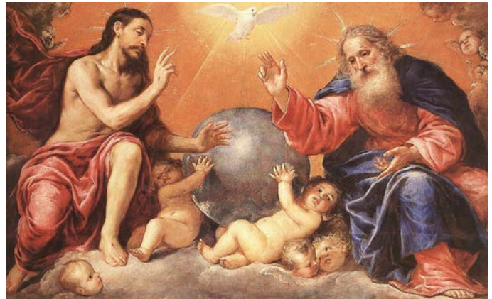
The Blessed Trinity blessing the world, with the Father portrayed as a grandfather and the Biblical image of the Holy Spirit as a dove.

The Father sent His Son, Jesus, to die on the Cross for you so that your sins could be forgiven and you could become an adopted child of God. Making the Sign of the Cross on yourself and praying in the name of the Father, the Son and the Holy Spirit will remind you of God's incredible love for you and each person.