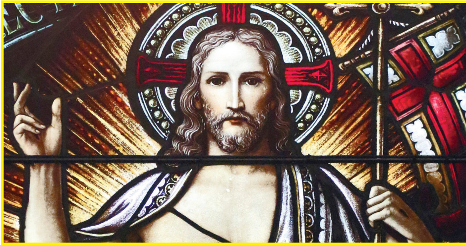
The Risen Christ appeared to the Apostles and said, "Peace to you." Why are you troubled... See My hands and my feet, that it is I myself?" (Luke 24: 36, 38-39)