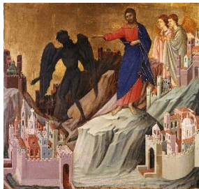
Jesus tempted by the devil

There are three sources of temptation: 1) the world – referring to everything about human life and society that is in any way opposed to God; 2) what Scripture calls “the flesh” – referring to our fallen human nature; and 3) the devil – a “liar and the father of lies” (John 8:44) who is a fallen angel and is the leader of the fallen angels who rejected God and became evil. The fallen angels lure and entice us to give in to evil and disobey God.