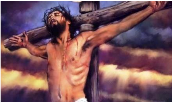
Jesus’ death on the Cross