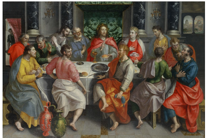
Jesus instituted the Holy Eucharist at the Last Supper