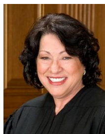
Justice Sonia Sotomayor