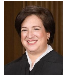
Justice Elena Kagan