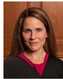
Justice Amy Coney Barrett