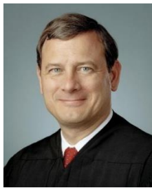
Chief Justice John Roberts

Let us ask God to give them the grace, wisdom, and courage to stand on the side of life and of the Constitution as written. Yes, let us pray that they overturn Roe v. Wade , the 1973 ruling that opened the door to abortion through all 9 months of pregnancy, resulting in the killing of more than 61 million unborn children (more than 10 times the population of the State of Wisconsin).