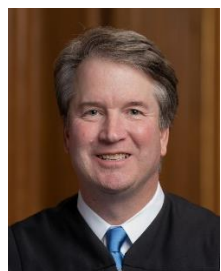
Justice Brett Kavanaugh