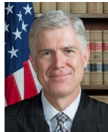
Justice Neil Gorsuch