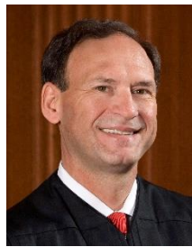
Justice Samuel Alito