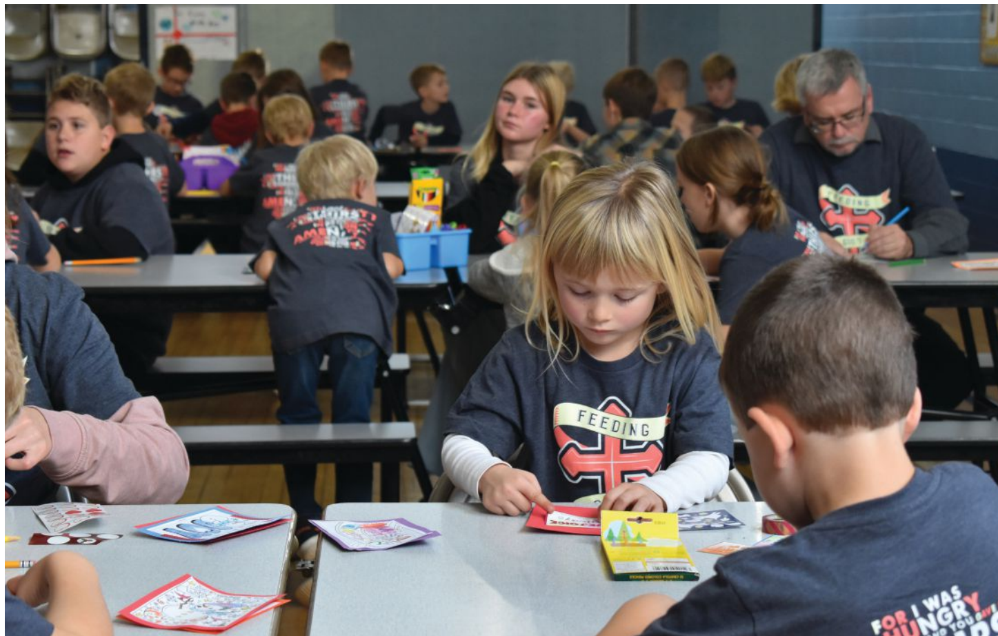
The gymnasium was loud and full of excitement while the energetic and focused students engaged their creative sides.

good thing because these kinds of days and these kinds of events are what they're going to remember about being a student at St. Mary's," she said. "Of course, everything we do is important and valuable, but I think the service projects are definitely a big takeaway."