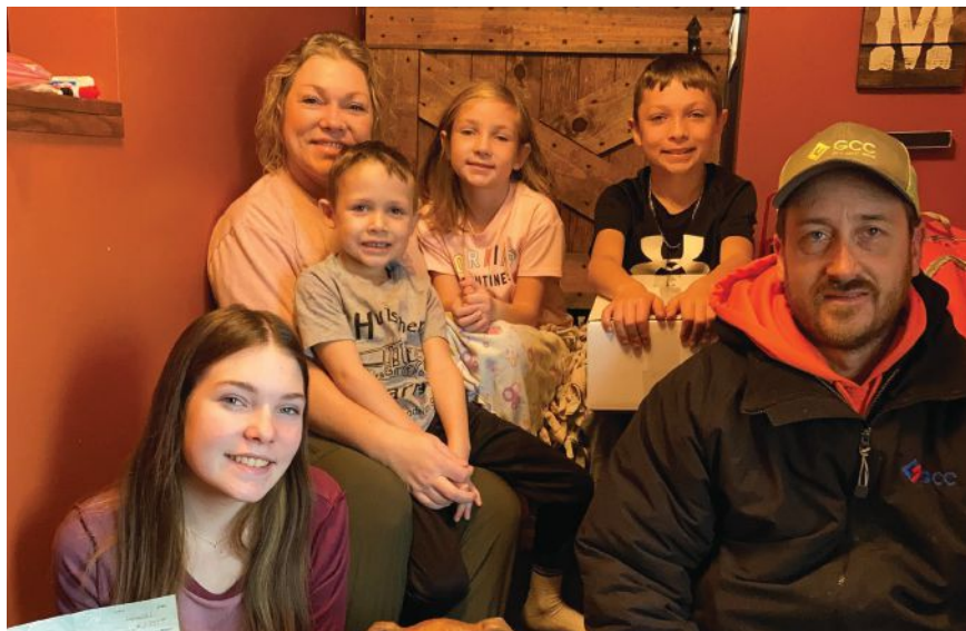
St. Nicholas 403, Kranzburg, S.D. Event: Dinner and bake sale Raised: $3,734