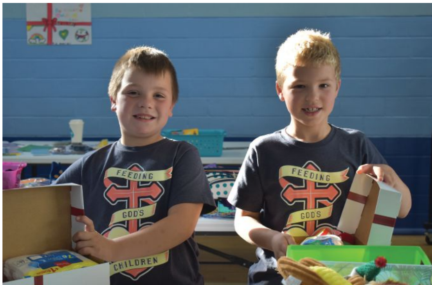
The gift boxes contained a variety of items: toys, socks, stuffed animals, and more!