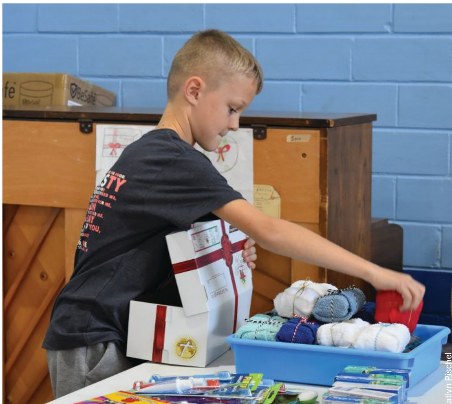
Enthusiastic students packed their boxes with care during St. Mary Catholic School's Box of Joy Project.