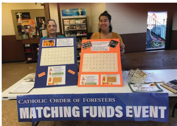
Our Lady of the Lake 2506, Ashland, Wis. Event: Creating sign boards Recipient: Our Lady of the Lake Catholic Community Raised: $12,204

These courts raised a total of $92,065. Courts featured in the 2021 editions of Catholic Forester raised $304,311.