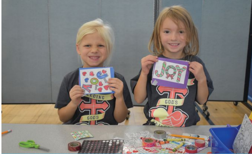
The students created cheerful greeting cards for each box of joy. St. Mary Catholic School has involved its students in creative service projects for years.