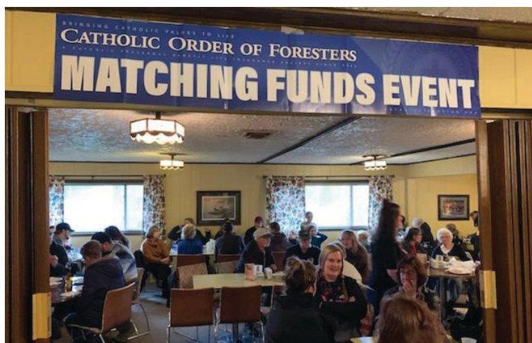
Bishop Neumann 1971, Haugen, Wis. Event: Dinner Recipient: Holy Trinity Parish Raised: $6,794