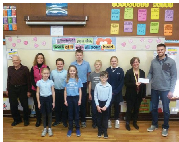
St. Peter 2034, Chippewa Falls, Wis. Event: Drive-thru dinner Recipient: St. Peter School Raised: $9,800