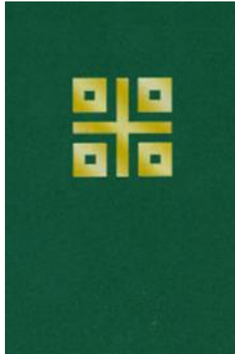
Ritual for Lay Persons