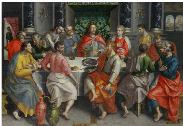
Jesus instituted the Holy Eucharist at the Last Supper.

Isn't it true that each of us needs to become more committed to speaking with Jesus on a daily basis? Being intentional about choosing a time for prayer each day and then being dedicated in order to deepen your relationship with Jesus is the path to true happiness (joy) and peace.