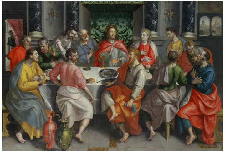
Jesus instituted the Holy Eucharist at the Last Supper.