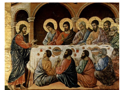
The Last Supper

Meaning of the Words of the Prayer to Jesus – explain one line at a time