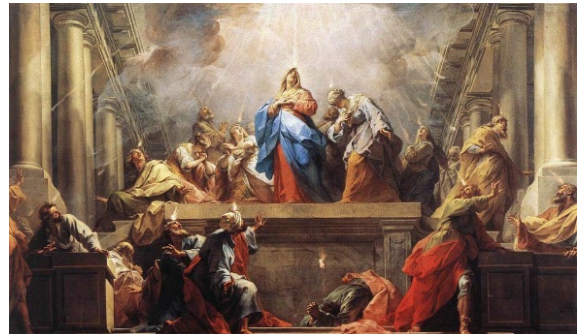
The Holy Spirit coming with great power upon Mary, the Apostles, and the women on Pentecost. (Acts 2:1-4) The Holy Spirit is a Divine Person. The tongues of fire are a Biblical symbol.

You will want to become more aware of how much God loves you. St. Paul tells us that "God's love has been poured into our hearts through the Holy Spirit Who has been given to us." (Romans 5:5) The Holy Spirit is the third Person of the Blessed Trinity. The Holy Spirit was sent by Jesus to live in your heart and bring you closer to Him. It is His power in you that enables you to recognize the voice of Jesus and follow His guidance.