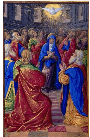
The Day of Pentecost