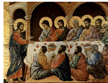
The Last Supper

Meaning of the Words of the Prayer to Jesus