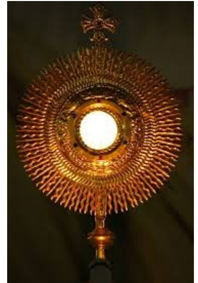
A monstrance with the Blessed Sacrament