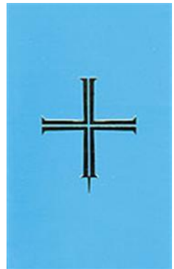
Book of Blessings: Abridged Edition (Tell us if you have a different version)