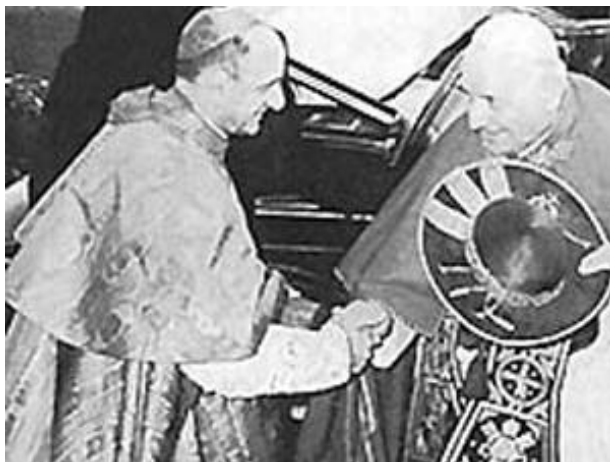
Cardinal Montini and Pope John XXIII

Sunday - 6:45am Mass, Morning Prayer, breakfast, departure