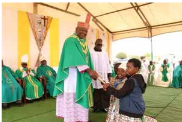
Children present to the Bishop the resolutions of the Congress