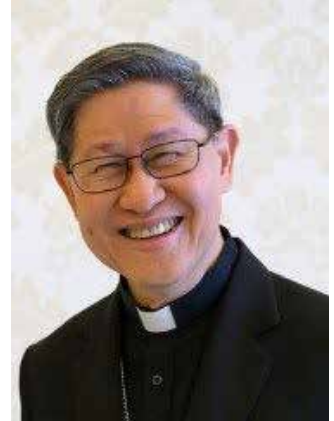
+ Luis Antonio G. Cardinal Tagle

Dear sisters and brothers in Christ, fellow missionaries of the Gospel, I welcome you, in the name of the Dicastery for Evangelization, the Section for First Evangelization and the Young Particular Churches, of the Pontifical Urbaniana University, and of the Pontifical Mission Societies to this International Missionary Meeting on the occasion of the Jubilee of the Missionary World and of Migrants being celebrated today and tomorrow. It is opportune and necessary to study together, to reflect together, to listen to each other, to learn from each other in a synodal way, as we deal with the topic: The Missio ad Gentes Today: Towards New Horizons . In this jubilee celebration, let us allow the theological virtue of Hope to point us to new horizons.