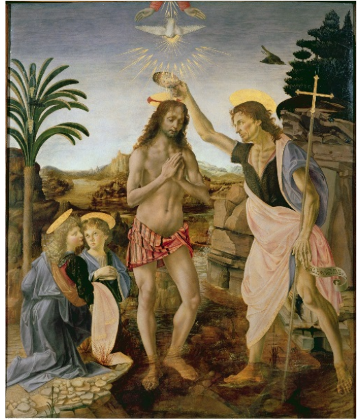
The Blessed Trinity revealed at Jesus’ Baptism with the Father’s voice, and the dove revealing the presence of the Person of the Holy Spirit

The Sign of the Cross prayer card can be downloaded from the website and inserted into a plastic sleeve to protect it. Go to diolc.org/deeper